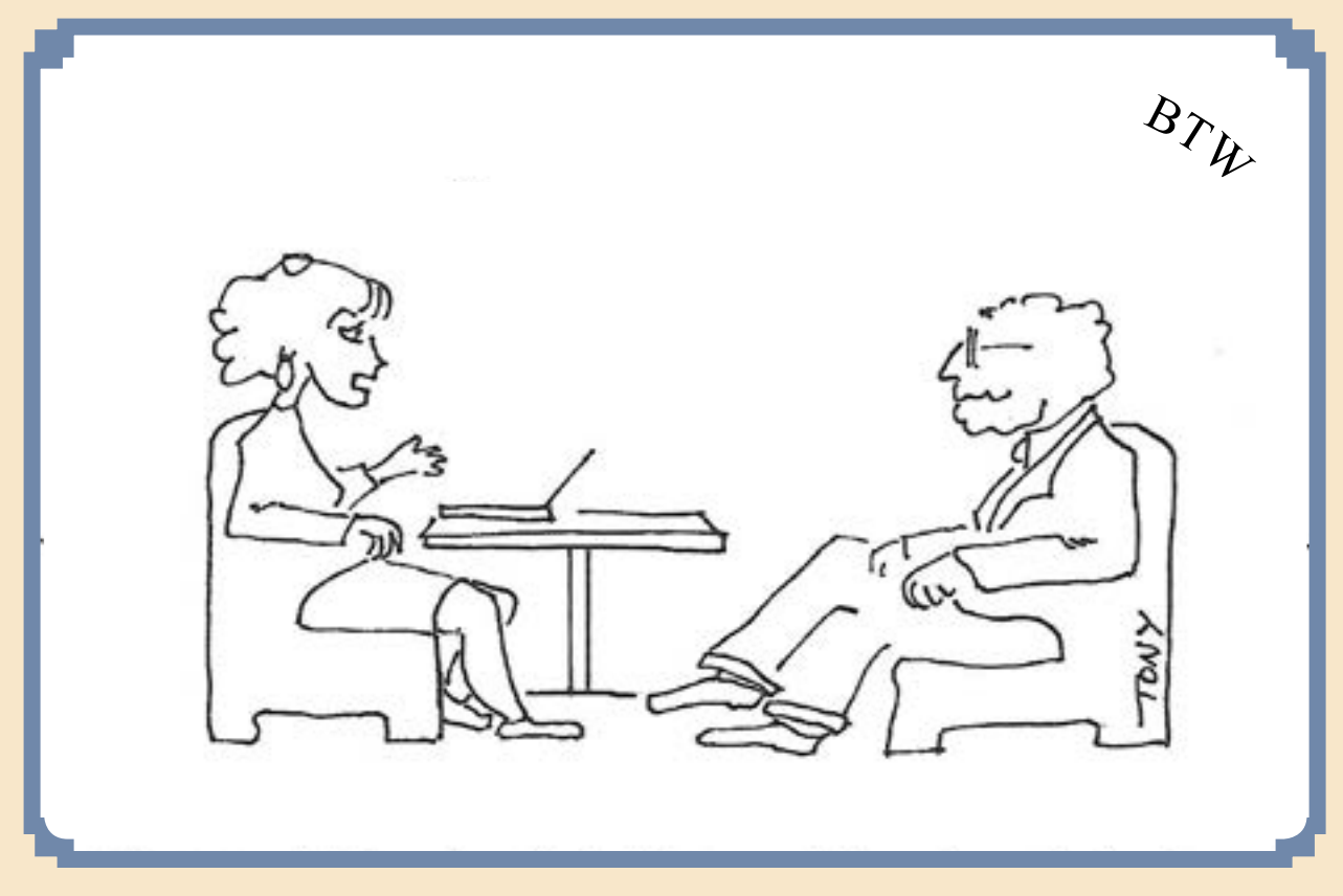
Aren't you just sick to death of being asked to take things to the next level?