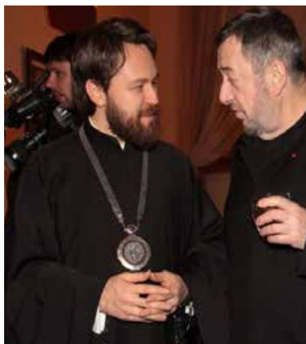
Unexpected collaborators: Metropolitan Hilarion Alfeyev and director Pavel Lungin. Note the body language (especially the hands).

How did the composition of the Passion come about? It emerged when Hilarion was serving simultaneously as Bishop of Vienna and Austria and administrator of the Diocese of Budapest and Hungary. “The idea came to me almost fully formed. I was driving from Vienna to Budapest, a route that I traveled very often. In six years of my service I drove that route 150 times. And