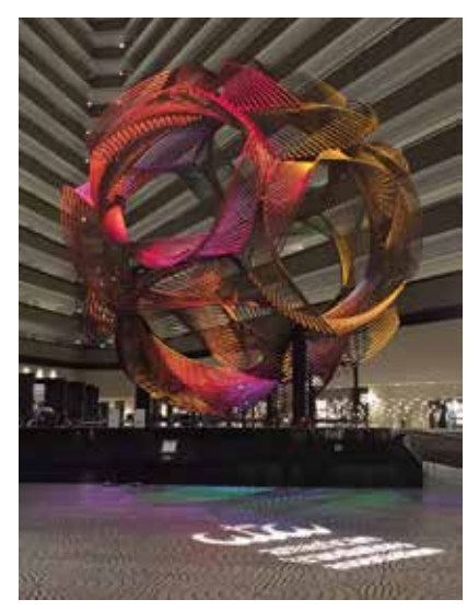
This salient feature of the Hyatt Regency Conference hotel lobby was the logical place to arrange to meet fellow SLD members before going out for a meal, drink or walk.

Finally, many of those present at the Annual Meeting expressed the opinion that the SLD should be more active on social media. We will do our best to reach our members through LinkedIn, Twitter and the SLD blog. A Facebook group is also in the works! If there are any specific topics you would like to see covered or you would like to volunteer to help with this effort, please let us know.