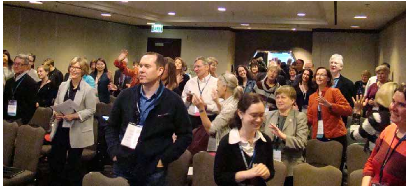
The conclusion of one of many well attended Slavic sessions at ATA57 in San Francisco.